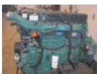
VOLVO VED "D" Series 125k Miles, 365hp #24172919 $9,500