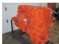
ISX400ST2 542k Miles, Real Strong Runner #24162565 $8,500