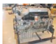
Mercedes MBE4000 450hp 337k Miles, Runs like a top! #24152854 $8,500