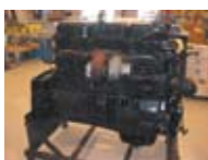
N14 CELECT+ Recent Overhaul #24169826 $5,250