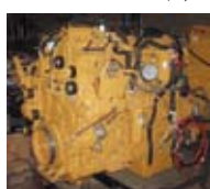
NEW 2007 C15 ACERT 600hp - Serial# SDP04199 $22,500 Exchange