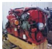
LIKE NEW ISX CUMMINS CPL2733 - 500hp $16,000 Exchange