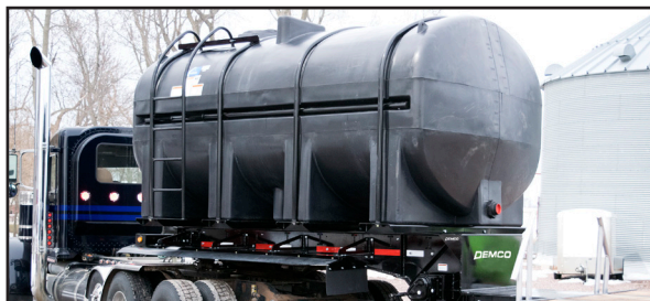
Black plastic liquid tanks eliminate light from reaching the interior contents preventing algae and microbes growth