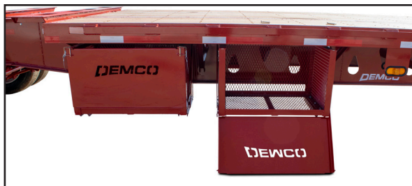
Optional storage bins