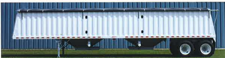
Steel Grain Trailers - Manufactured in 22', 26', 30', 34', 36', 38', 40' & 42'