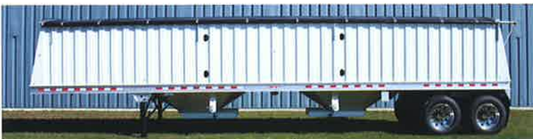
Aluminum Grain Trailers - Manufactured in 34', 38', 40' & 42'

Jet Company holds patents on several products. Its products are sold throughout the U.S., Canada, Europe, China, Central and South America.