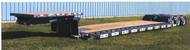
Detachable Gooseneck Trailers - Superior quality, hard working trailers built to stand the test of time. Available in 35 ton or 51 ton series & your choice of models.