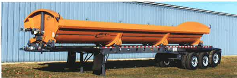
Side Dump Trailers - No center divider, trunnion mounted inverted cylinder & external supports provide for unprecedented side dump stability.